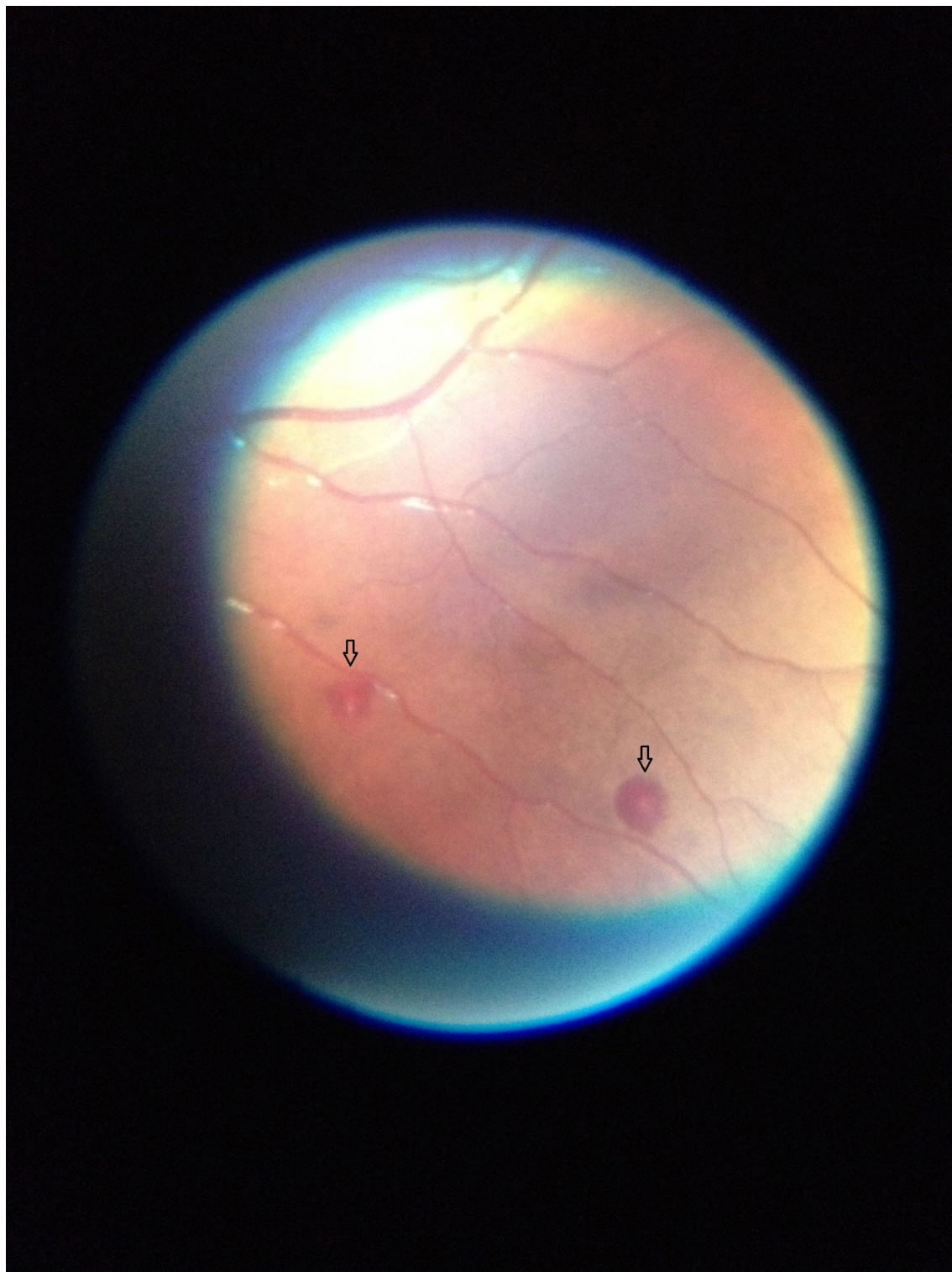
Fig. 2. Fundus photograph of a paediatric patient showing white-centred retinal haemorrhages (see arrows).

the research clinician was available at the study site. This illustrates the difficulties of efficiently implementing funduscopy in the field to help manage CM. Most children had an MR and the most common feature was haemorrhage. An autopsy study in Malawi found that severity of haemorrhage in the retina correlates with that in the brain 32 . Our data enabled us to explore the association between characteristics observed at admission and MR in patients with CM. A consultation with a traditional practitioner before admission was associated with MR. However, there was no association between the duration from the onset of symptoms to hospital admission and consultations with a traditional practitioner, which could explain this association. In addition, MR was