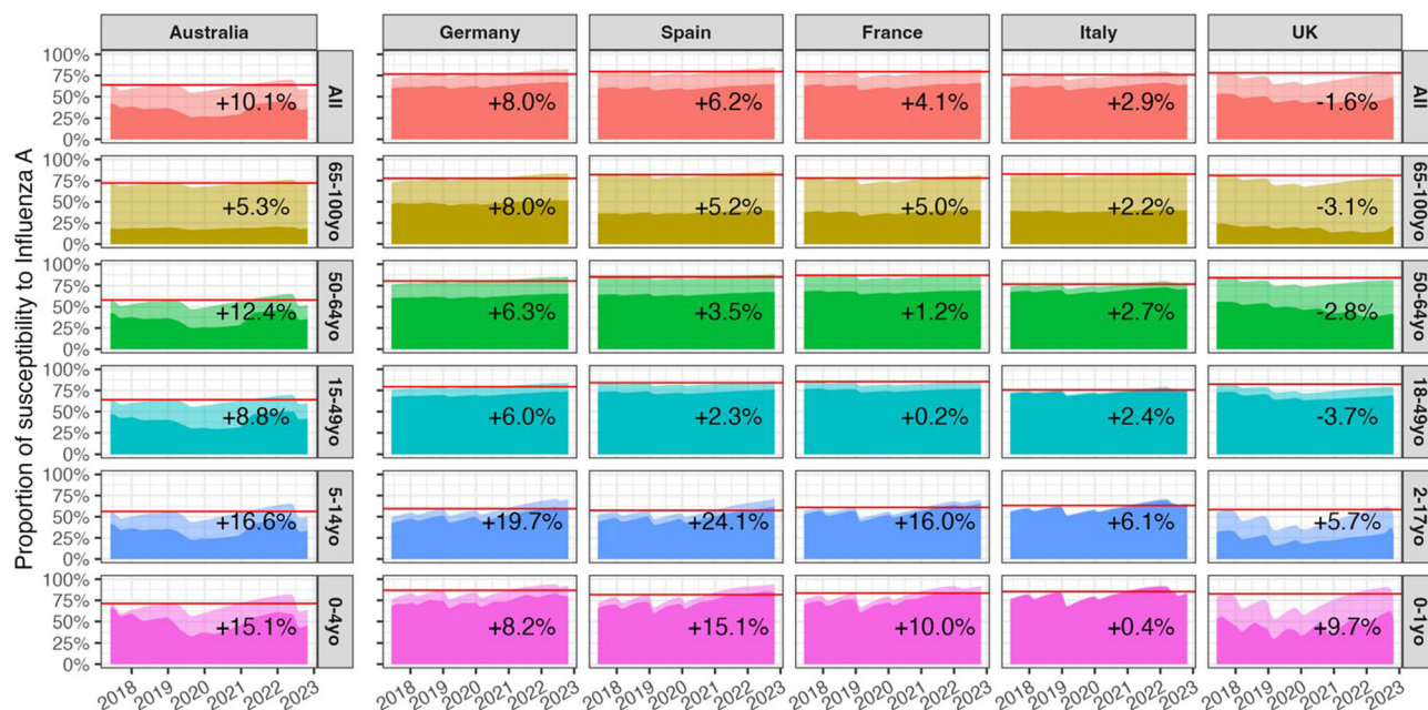
FIGURE 2 Evolution of the population susceptibility to influenza A (H1N1 and H3N2) since 2017 by age group in Australia, Germany, Spain, France, Italy and the United Kingdom. Horizontal red lines show the maximum level of susceptibility before January 2020. The percentage of increase (or decrease) displayed on the plots are computed for the highest susceptibility level ahead of the 2022 (Australia) and 2022–2023 (Europe) influenza season compared with the red lines. Transparent areas stand for susceptible who vaccinated.