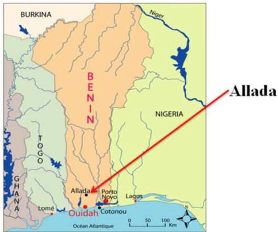
Fig. 1. Map showing the location of Allada (the study site) in Benin.

electronic scale (SECA type 354) and a locally manufactured wooden measuring scale, respectively. Trained research nurses performed cognitive assessments. Z-scores for the weight-for-length (WLZ), length-for-age (LAZ) and weight-for-age (WAZ) of all the children in our study were estimated using the 2006 World Health Organization (WHO) Child Growth Standards as a reference for each indicator [14]. Stunted growth was defined as LAZ less than -2 , whereas wasting, a characteristic associated with acute starvation and/or severe malady, was defined as WLZ less than -2 . Underweight was defined as WAZ less than -2 .