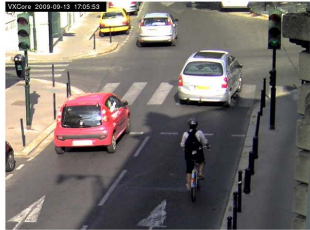
Figure 2. Picture of detected cyclist from behind at a 45 degree angle.