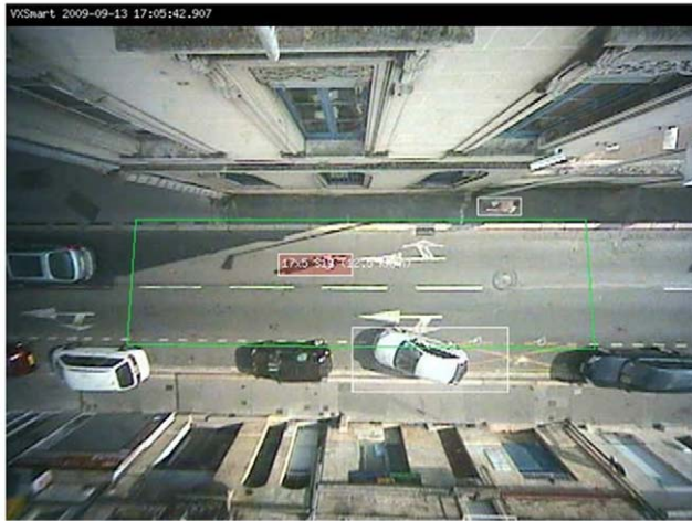
Figure 1. Capture of a cyclist's movements by a camera from a vertical angle.