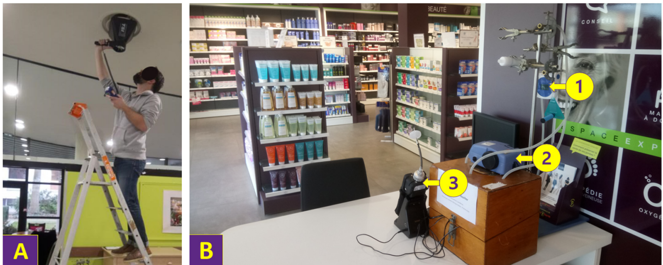
Figure 1. Examples of the flow rate measurements of an air vent in the refectory of an elderly care facility (A), and of the CO 2 (1), PM 2.5 (2) and TVOC (3) measurements in the commercial space of a pharmacy (B).

The characteristics of the buildings and sampled rooms have been described in a previous article [19]. Regarding the ventilation characteristics, all elderly care facilities had mechanical ventilation (4/4), and 50% of dental offices (1/2) were fitted. The air change rate of mechanical ventilation was calculated in each room using the volume of the room measured with a laser rangefinder, and the flow rate of each air vent of mechanical ventilation measured once during the study with Q-Trak ® 7565 (TSI Inc., Shoreview, MN, USA) (Figure 1A). In the elderly care facilities, the air change rates of mechanical ventilation were 0.4 \pm 0.4 Vol/h (range: 0.1–1.0) and 0.4 \pm 0.3 Vol/h (range: 0.2–1.0) in common rooms and bedrooms, respectively. In the fitted dental office, they were 0.3 and 0.8 Vol/h in treatment room and waiting room, respectively. General practitioner offices and pharmacies used only natural ventilation. All the studied rooms had exterior walls with openable windows, except for a pharmacy in a shopping arcade and the sterilization room of a dental office.