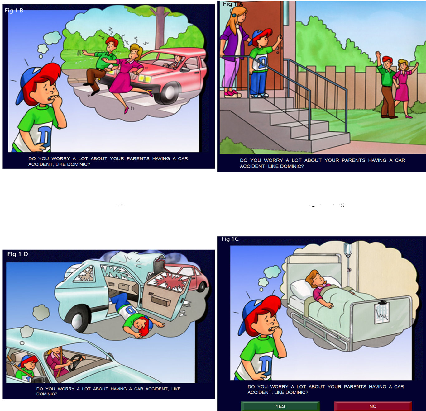
Fig 1. Pictures and text illustrating DI survey questions. (A-C) accompany, “Do you worry a lot about your parents having a car accident, like Dominic?”, whereas (D) accompanies the question, “Do you worry a lot about having a car accident, like Dominic?”. Reprinted from the Dominic Interactive under a CC BY license, with permission from DIMAT.

https://doi.org/10.1371/journal.pone.0181619.g001