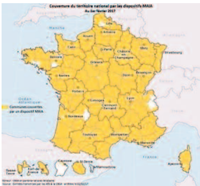
Figure 1. National coverage of the MAIA scheme on 1 February 2017